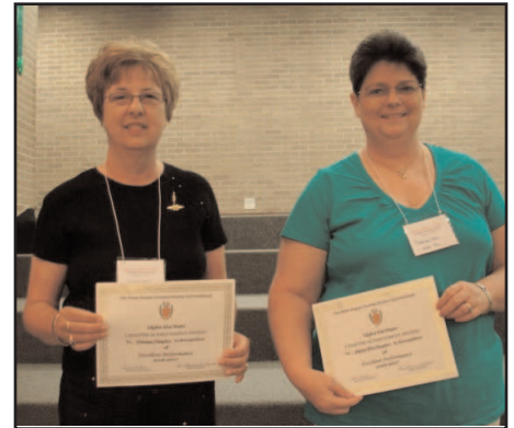
EXCELLENT ACHIEVEMENT AWARDS OMEGA, ALPHA NU, ALPHA PI, ALPHA PHI

BETA BETA, GAMMA, THETA, LAMBDA, NU, PI, SIGMA, PSI, ALPHA GAMMA, ALPHA ETA, ALPHA MU, ALPHA XI, ALPHA UPSILON, ALPHA PSI, BETA GAMMA, BETA THETA, MU, ALPHA RHO