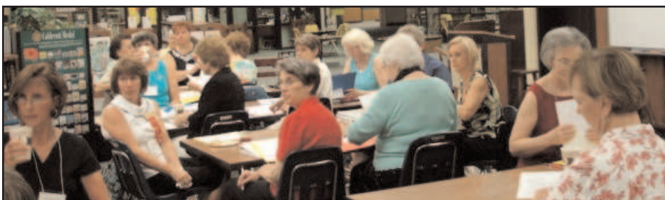
Committee members and chairs participate in a workshop.