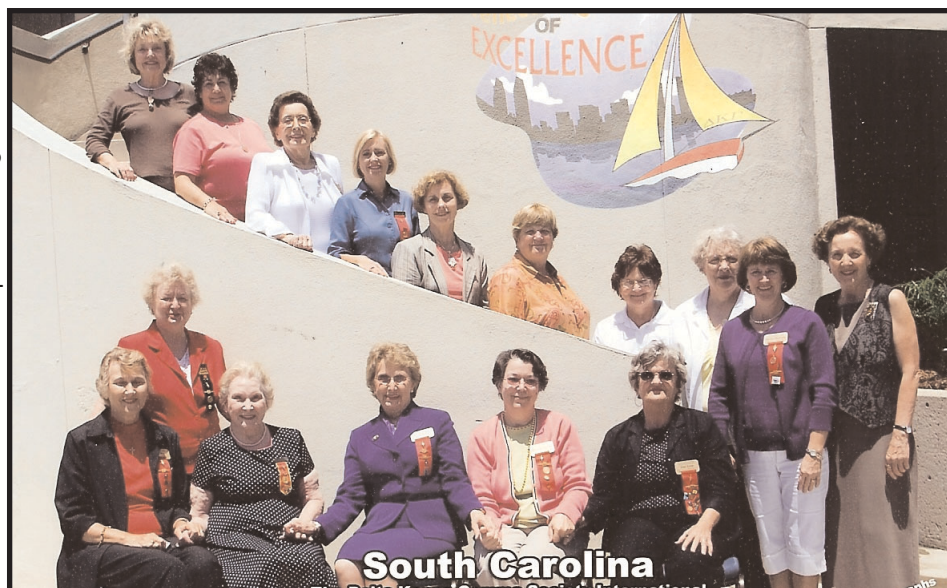
Alpha Eta State Sisters at International Convention

After the inauguration of officers at the Saturday night banquet, the international sisters joined hands to sing the “Delta Kappa Song” with a promise to see one another again at the 2008 International Convention in Chicago.