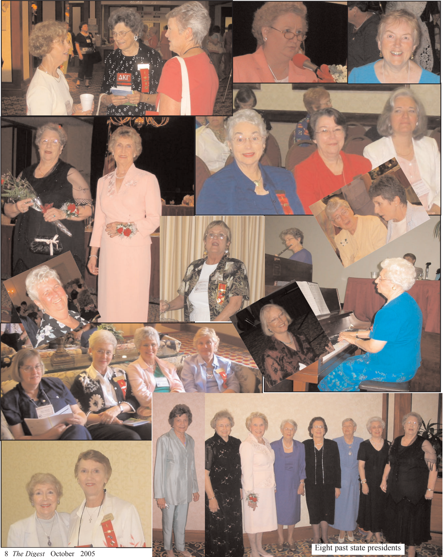
Eight past state presidents