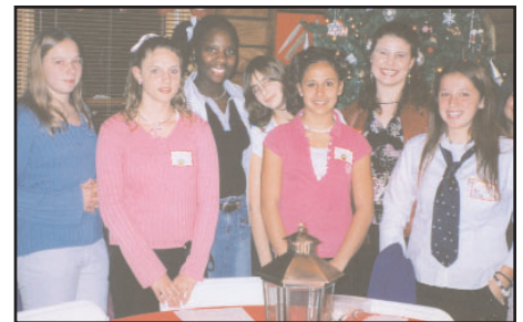
These girls are residents of the Abney Cottage at Connie Maxwell Children's Home.

The chapter has sponsored the cottage for years with gifts for the girls.