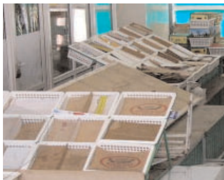
Stores are stripped of products.