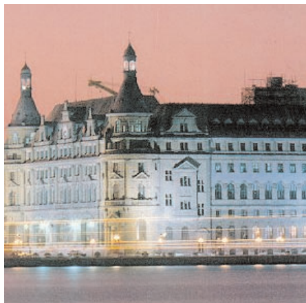
Haydarpasa in Istanbul

Her work will continue through the spring of 2006. Contact her at ppmulligan@yahoo.com.