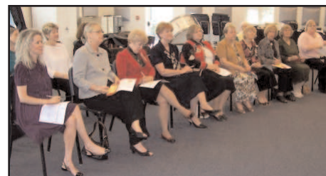
These initiates are charter members of Beta Kappa.