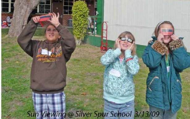
Sun Viewing @ Silver Spur School 3/13/09