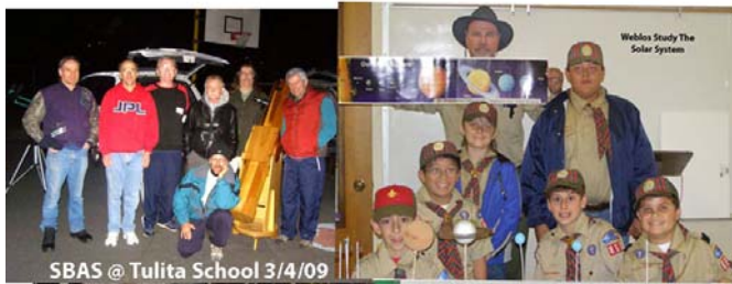
SBAS @ Tulita School 3/4/09

Here is a brief recap of the month's events: