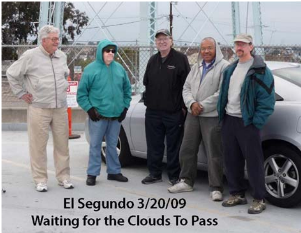
El Segundo 3/20/09 Waiting for the Clouds To Pass

http://www.astroleague.org/observing.html .