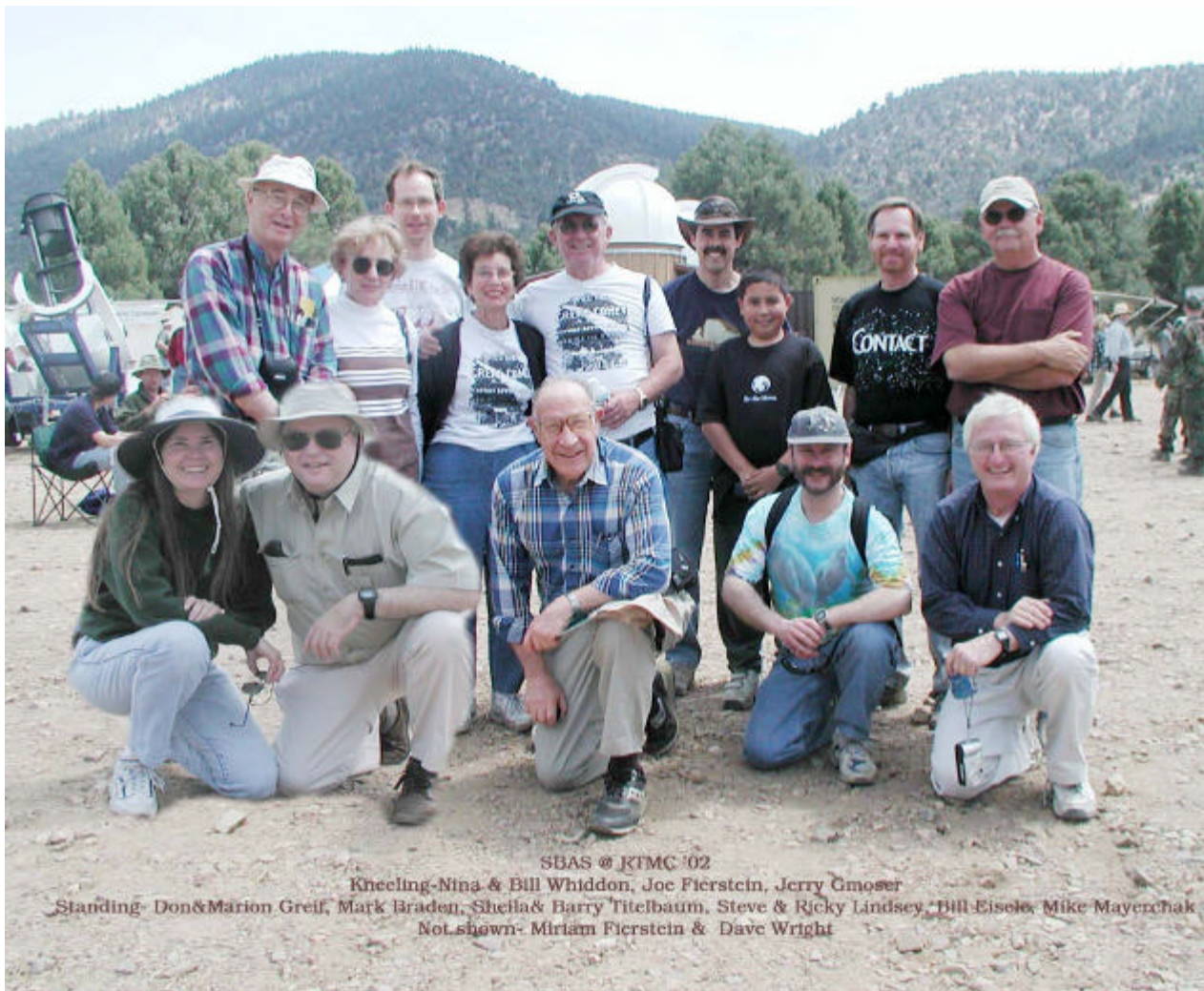
SBAS @ RTMC '02