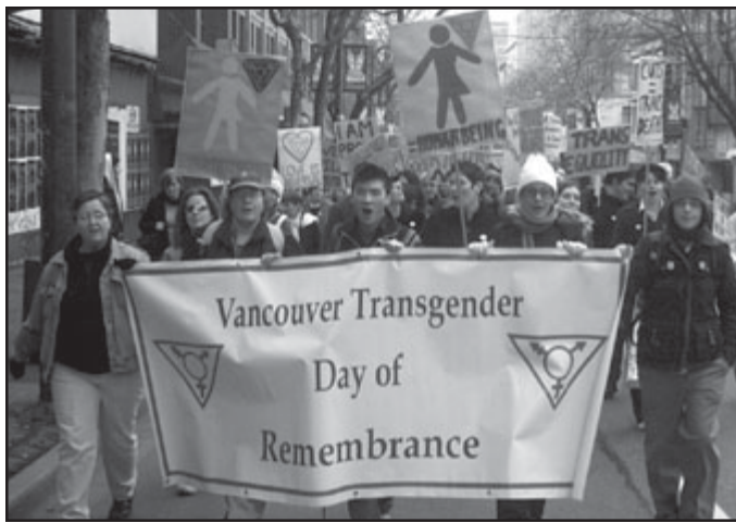
Trans Day of Remembrance: Marchers showed their support for Trans victims of hate crimes in November 2005.