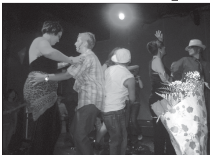
Climax: Last year's show featured a group number's by Vancouver's DKUnited, a drag king troupe..