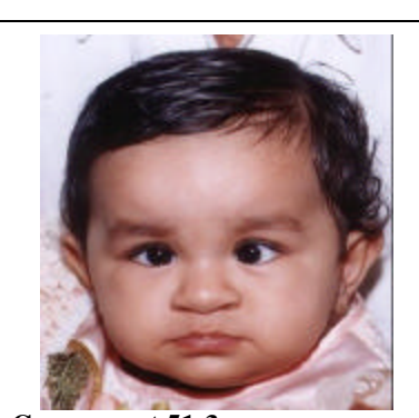
Case report 51-3 Baby aged 1 year, a case of Nystagmus blockage syndrome. See case report 51-3.