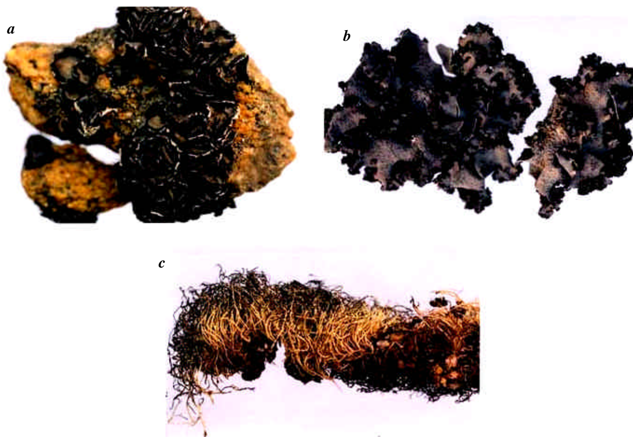
Figure 2. Some prominent macrolichens of Schirmacher Oasis, East Antarctica. a , Umbilicaria aprina Nyl; b , U. africana (Jatta) Krog & Swinscow; c , Usnea antarctica Du Rietz.