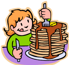
TABLE FOR YOU...

Just a reminder that next weekend is our monthly pancake breakfast. It's a great way to build community.