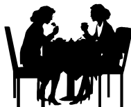
TABLE FOR TWO