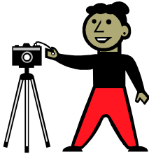
TABLE FOR TWO

So... keep your eye on this newsletter for more information in the fall. And look at your gifts and talents to see if maybe you can help (Phoners? Photographers? Publishers?).