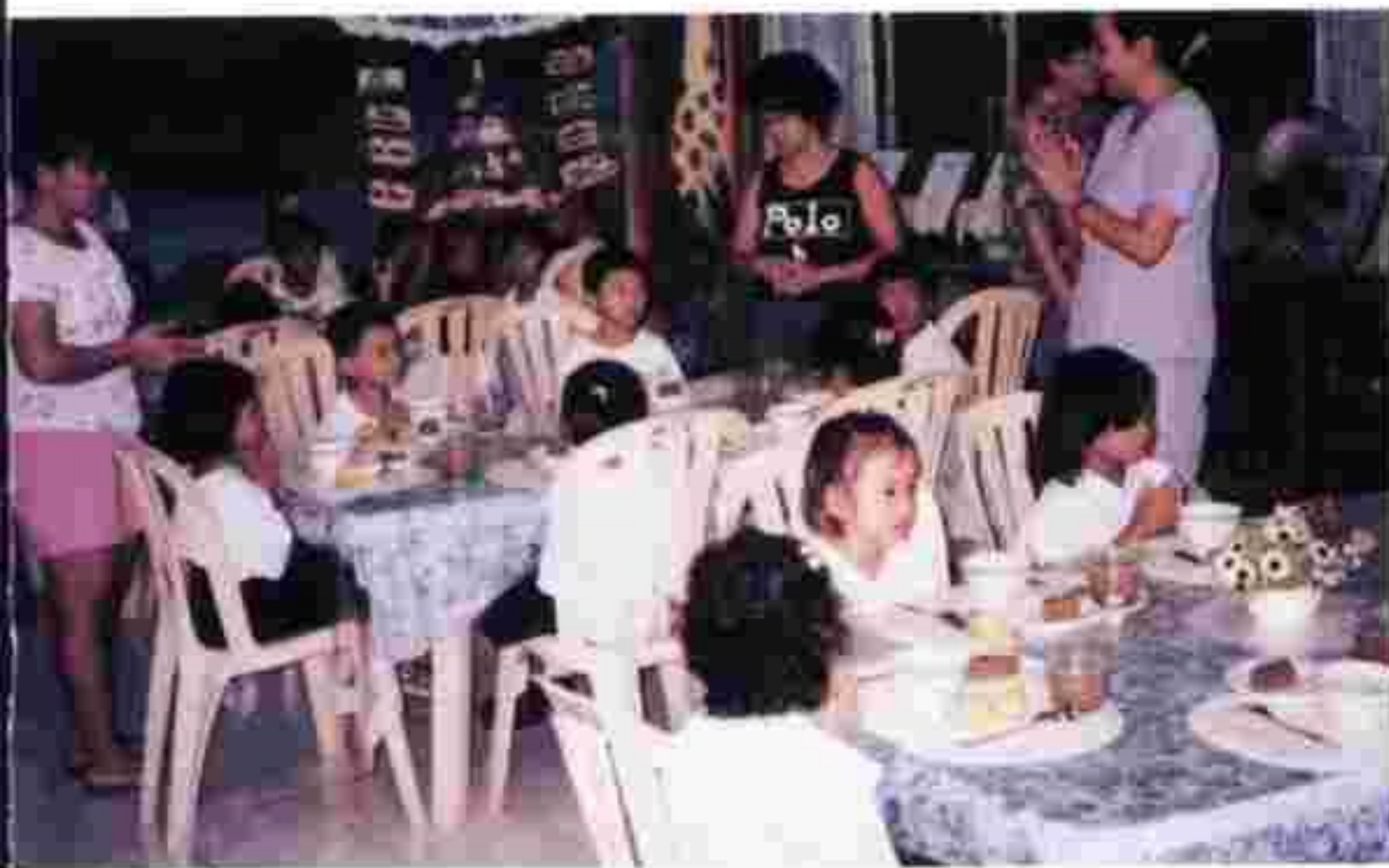
RC Pasig Sunrise conducted feeding program for the grade school children of Pasig Elementary School.