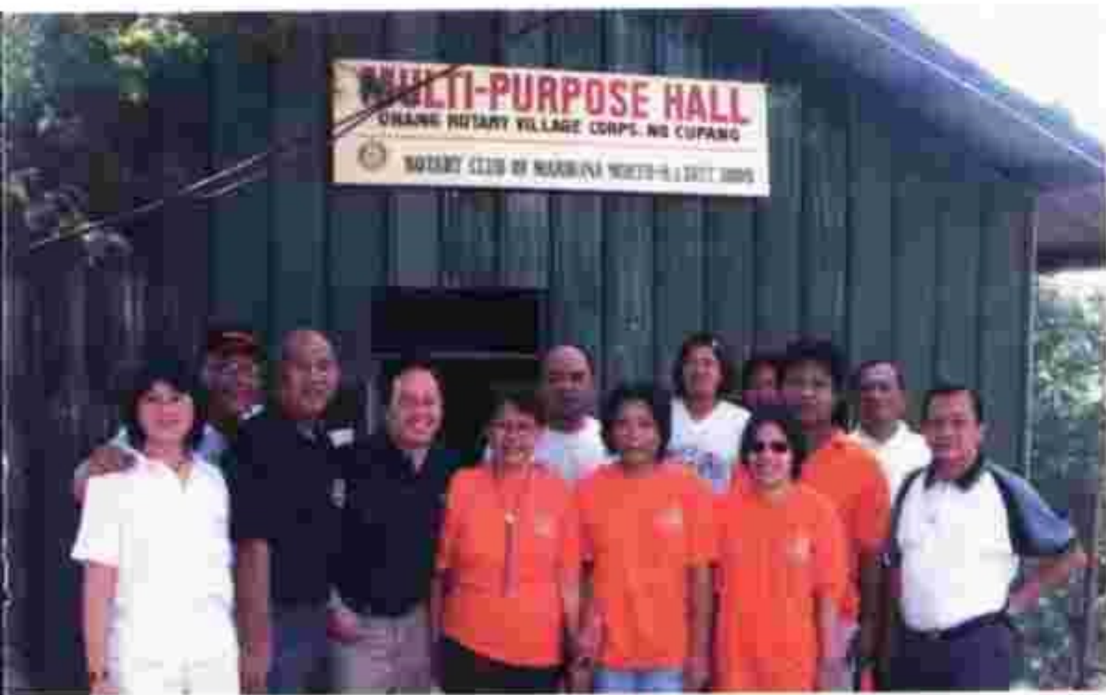
Marikina North rebuilt the 12-year old Multi-purpose Hall of Rotary Community Corp. of Cupang, Antipolo, at a cost of PhP 68,000 - complete with 2 toilets. From being the venue of the RCC's regular meeting, the hall will house the learning center of the RCC for 30 pre-schooler children