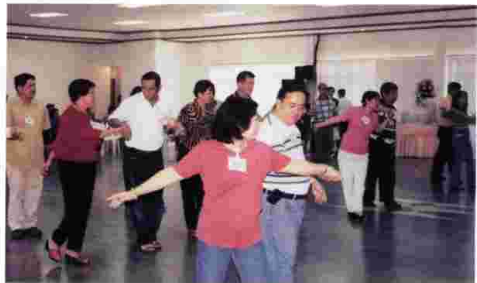
The Loving Presidents and their spouses enthusiastically learning the dance steps for the Governor's Ball.