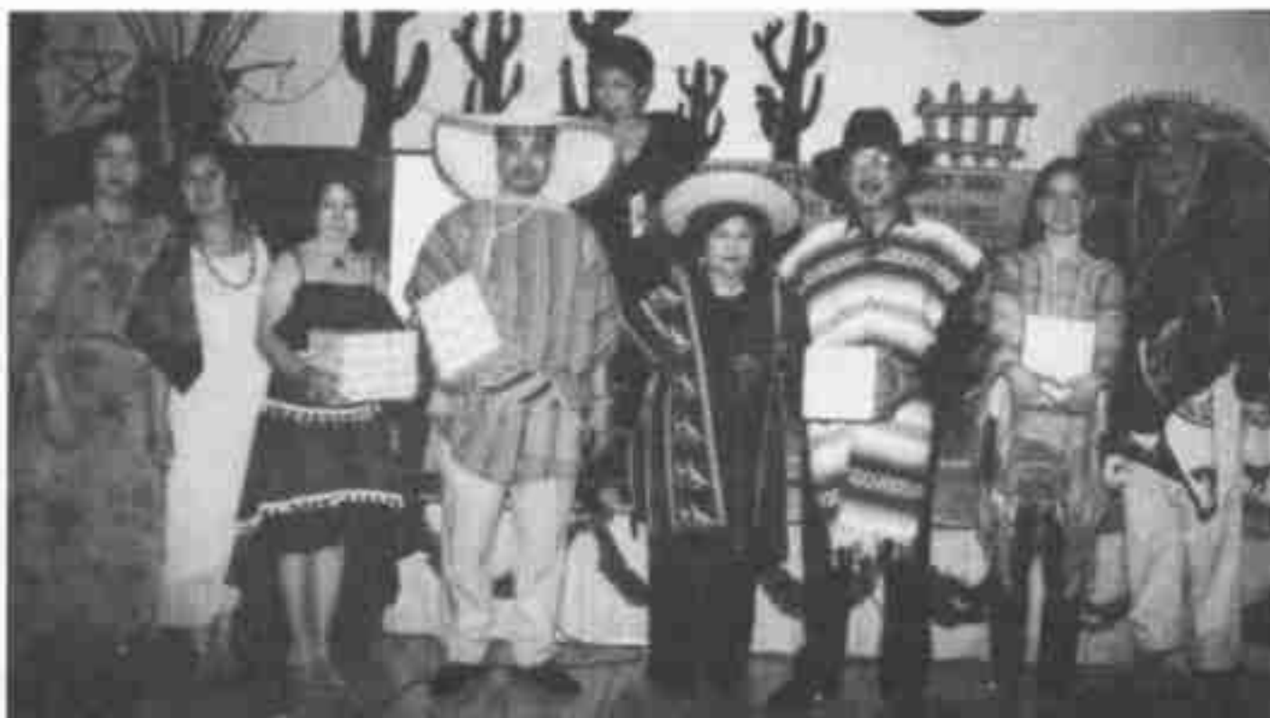
"Best Dressed Mexicans" awardees