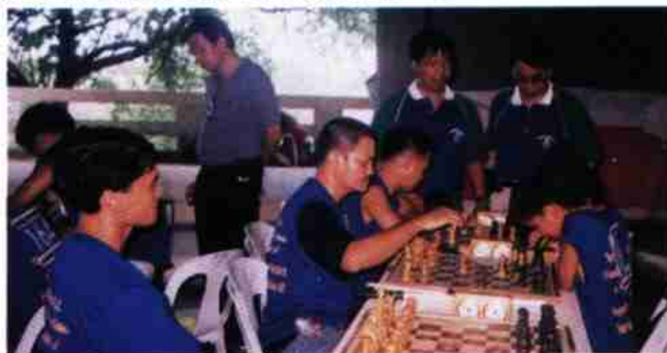
The VIPs are all concentration in the chess games

As an overview of the organization and logistics provided, as early as July 2002, preparation for this Blind Sports Championship has commence with weekly and monthly meetings were held by the organizing committees, from the Rotary Club of North Bay East, Philspada, Phil. Sports Commission and different organization and school for the blind. Last Nov. 23, a care giving orientation for the visually impaired persons was conducted at the Philspada office with Rotarians and Officials participating. As early as Nov. 28, Nov, 29 athletes from the provinces started arriving and we have to meet them and book them at the Philsports dormitory for their accommodation, and provide them with electric fan, purified water and their food, breakfast, lunch and dinner during their stay up to Dec. 1, 2002. Lunch and snacks, morning and afternoon was also provided during the November 30, competition with give away from our sponsors, like Speed bar soap, Shark en-