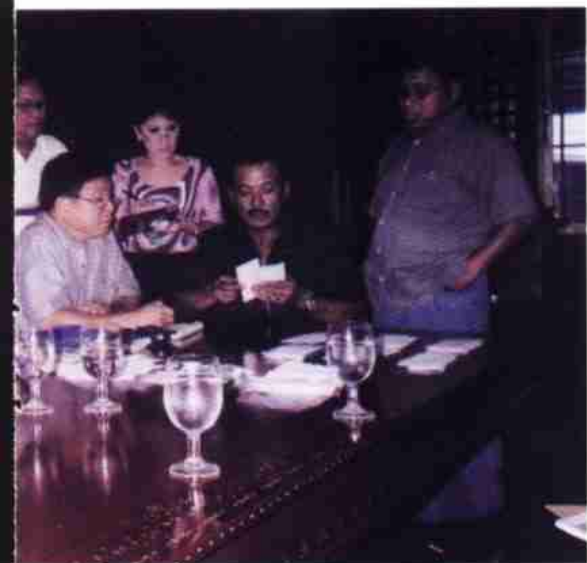
at Club Filipino under watchful eyes of the representatives