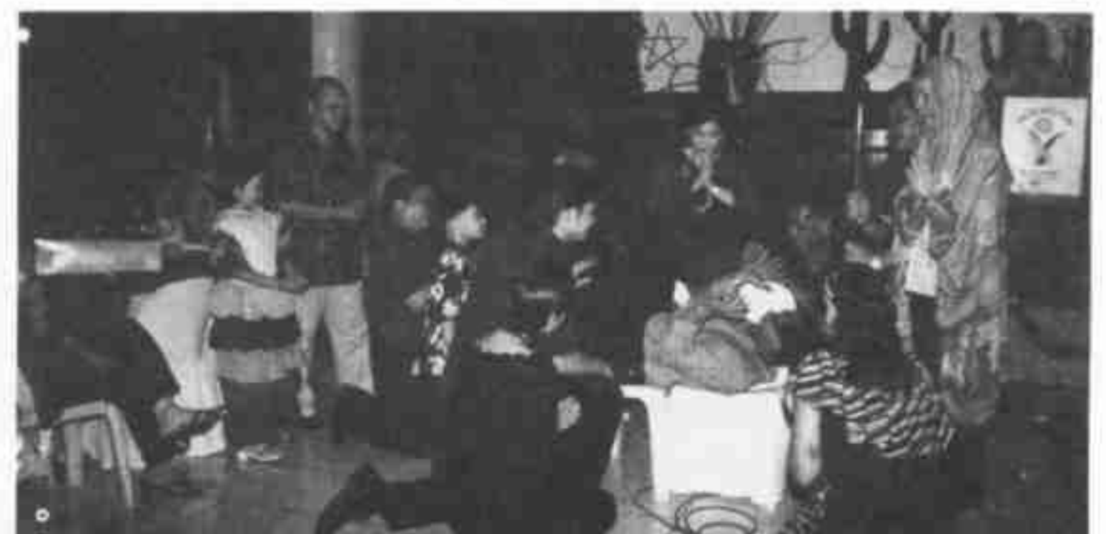
One of the skit presentations that delighted the crowd.