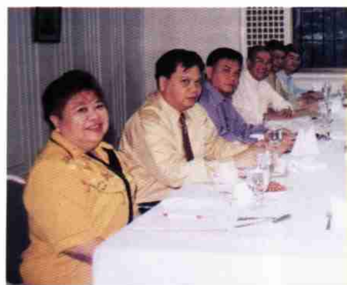
The members of the District Nominating Committee for R...