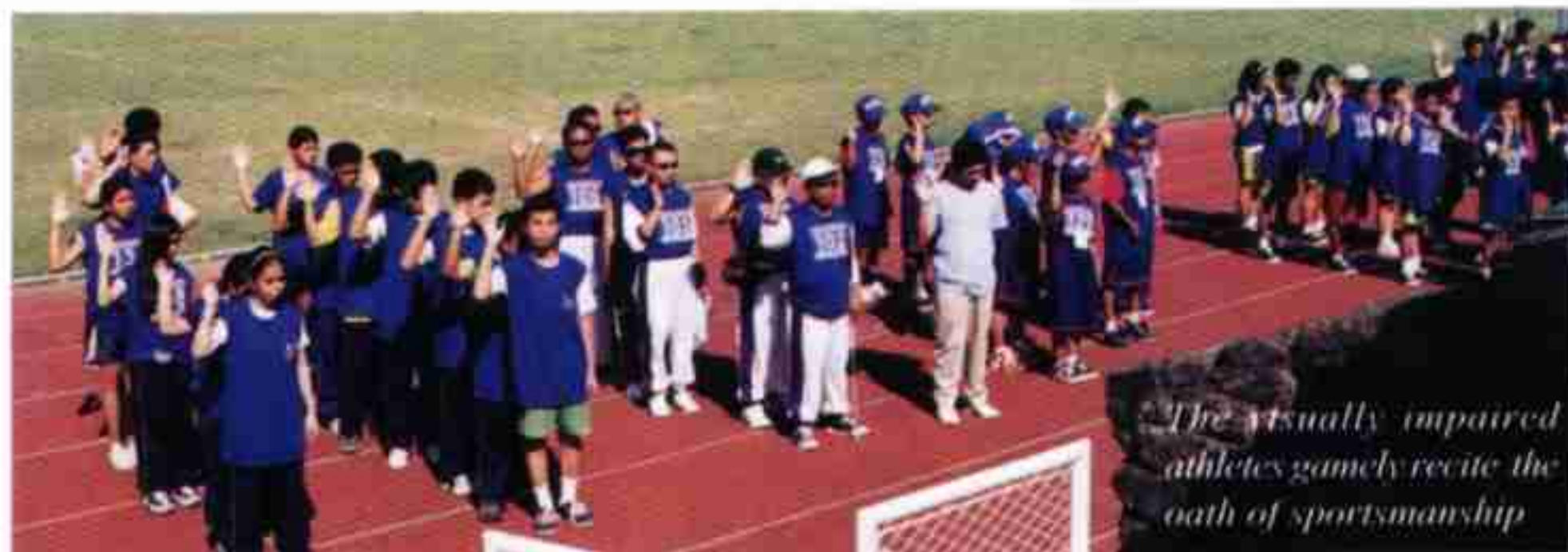
The visually impaired athletes gamely recite the oath of sportsmanship