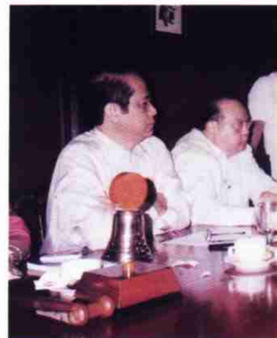
Election of DGN. Canvassing of ballots held of the three candidates.