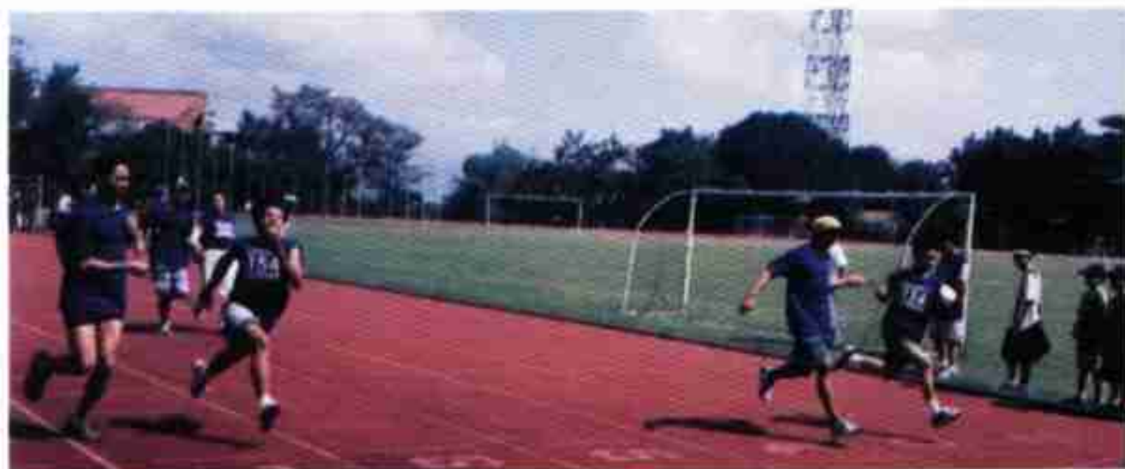
The visually-impaired athletes, with the help of their care-givers were very competitive in the 100-m dash