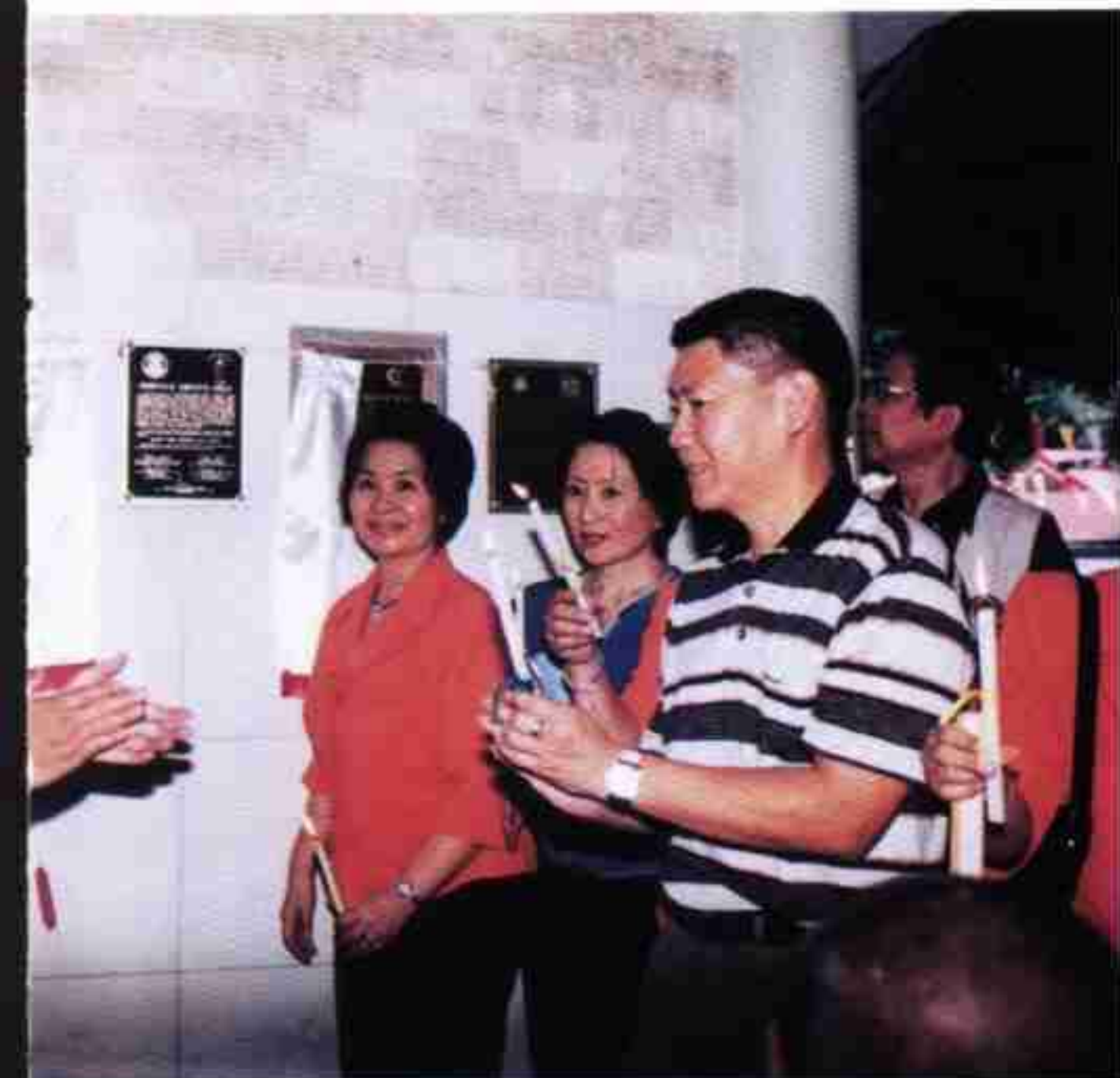
ue for projects undertaken this Rotary Year at the Home For The Aged.