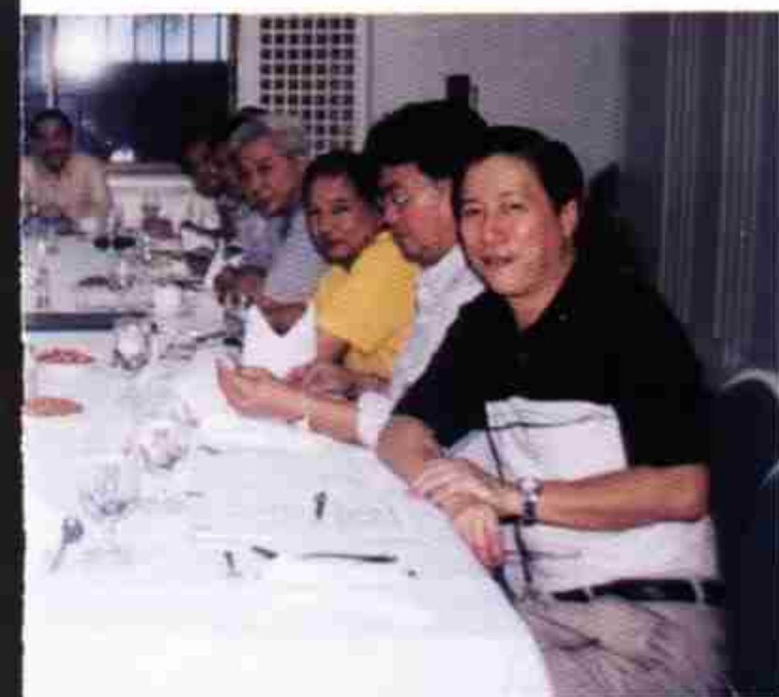
2002-2003 during their meeting held at Club Filipino.