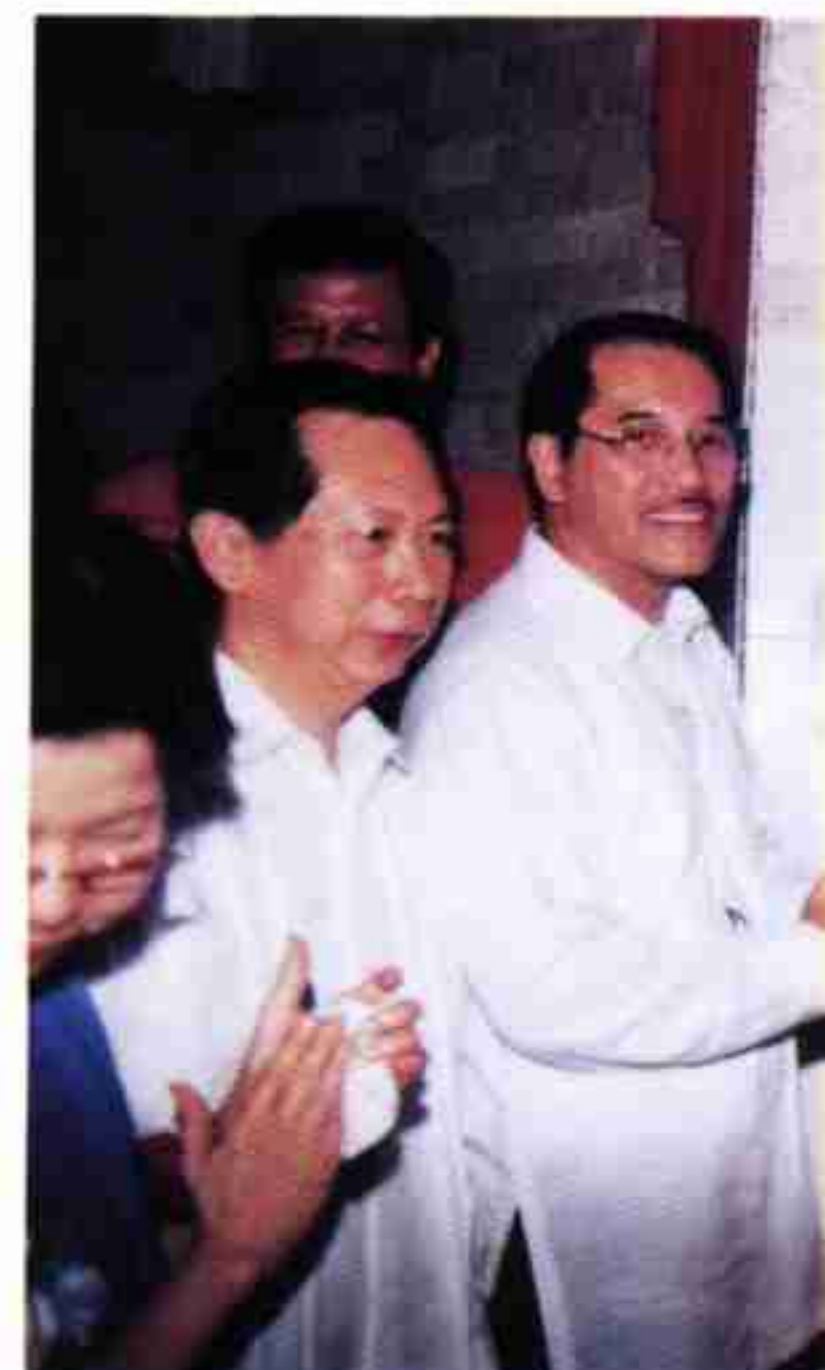
Home for the Aged Unveiling of the pla...