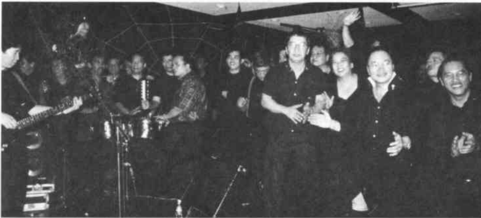
Some Rotarians and spouses rockin' and rollin'.

If ghost and goblins enjoy rock and roll, their flighty spirits would have been drawn to Rotary District 3800's "Halloween Rockin' n Rollin'" held last October 28, 2002.