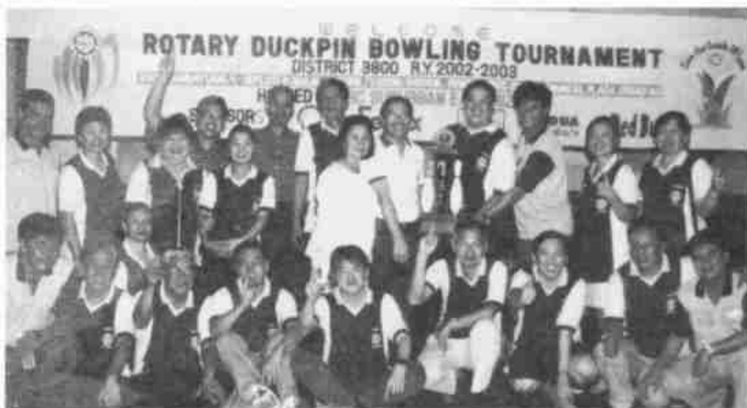
The mighty bowlers of Team RC Valenzuela West emerged victorious as the over-all champion in the Men's Division.