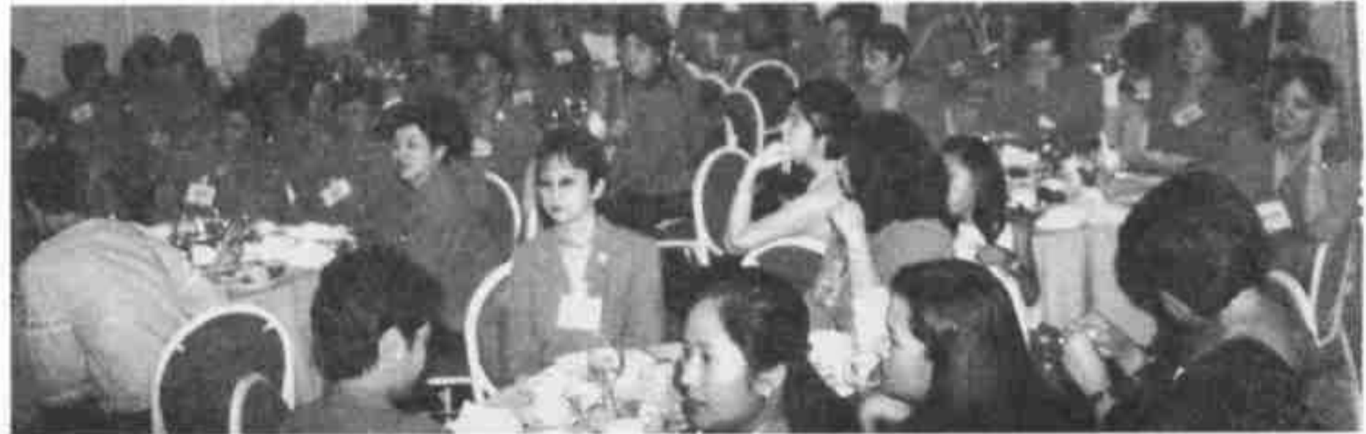
A shot of the more than a hundred spouses who attended the breakfast meeting.

At the same time, the birthday celebrants for the months of August and September were acknowledged and given simple tokens by DGL Pam de Guzman, highlighted by the blowing of the candles on a birthday cake by the celebrants themselves. The early birds received tokens, while the Zone with the most number of attendees