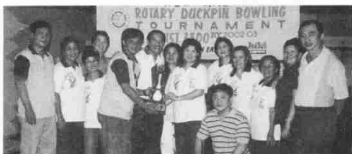
Team RC Metro Valenzuela was the over-all champion in the Ladies Division of the recently concluded District Duckpin Bowling Tournament.