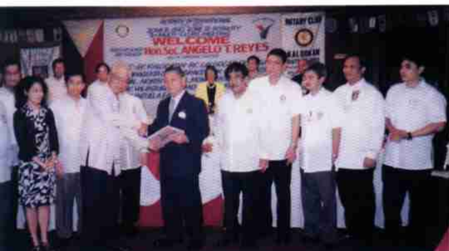
Caloocan and Valenzuela Zones' Joint Intercity Meeting was held at the Grand Hotel with Sec. Angelo T. Reyes of the Department of National Defense as the guest of honor and speaker. 135 Rotarians attended the affair which was hosted by Caloocan and RC Caloocan Silangan.