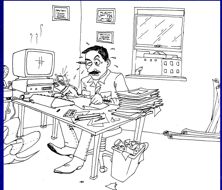
Table of Contents— Journalism