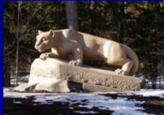
Table of Contents—Journalism