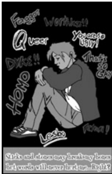
Poster by Jack Thompson and Andy Duran.

Liberation Ink is a series of 7 posters created by youth to make change in schools. These posters are distributed by GSA Network. High school and middle school GSAs in California can order up to 30 free posters, and they are available for a small price plus shipping to anyone else. They represent youth voices for justice, peace, and youth empowerment and speak out against hatred, harassment, and discrimination of all kinds. Some of the posters specifically address slurs. Use the posters in classrooms or in visual displays to raise awareness and confront derogatory language at your school. For more information on how to order the posters, and to see what they look like, visit: www.gsanetwork.org/freezone .