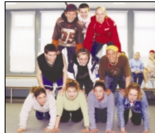
Having fun during a regular drop-in