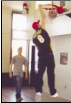
Basketball League Wednesday night — Games Room during drop-in