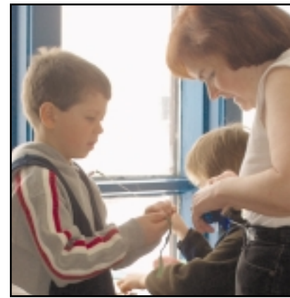
The Craft Room is a popular place to be

Quotes taken from “Together With Youth - Planning Recreation Services for Youth-at-risk”. © September 1999 Parks and Recreation Ontario