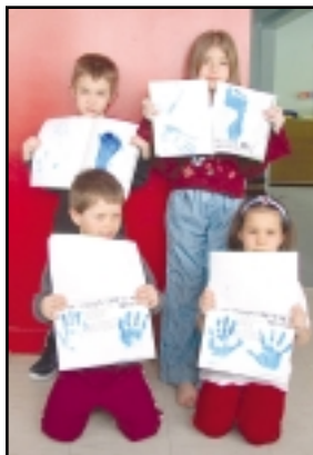
A painting exercise during March Break — Homework Club Wednesday Night

“When children and youth participate in sports, cultural programs and other recreational activities, they have better psychological health, improved familial interactions, and perform better academically. They also relate better to their peers and have a better awareness of their community. This is particularly important for young people who are at risk for developing longterm health or social problems.” – “The Progress of Canada’s Children” Canadian Council on Social Development, 1996.