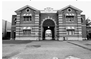
Bogo Road Gaol - http://www.boggoroadgaol.com.au/

According to reports British prisons are again reaching a crisis point where overcrowding is an issue (The Courier Mail). One may recall a time in history when this resulted in scores of convicts sent to Australia (late 1700s).