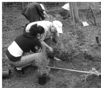
Planting trees - http://www.nuestras-raices.org/

http://www.ucsusa.org/global_warming/solutions/ten-personal-solutions.html