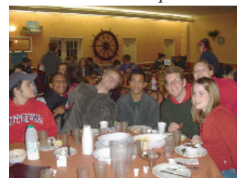
The semester in pictures: