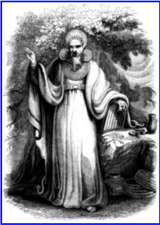
Charles Knight, "Arch-Druid in his full Judicial Costume" etching from Old England: A Pictorial Museum (1845)