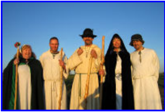
Modern druids in the early morning glow of the sun