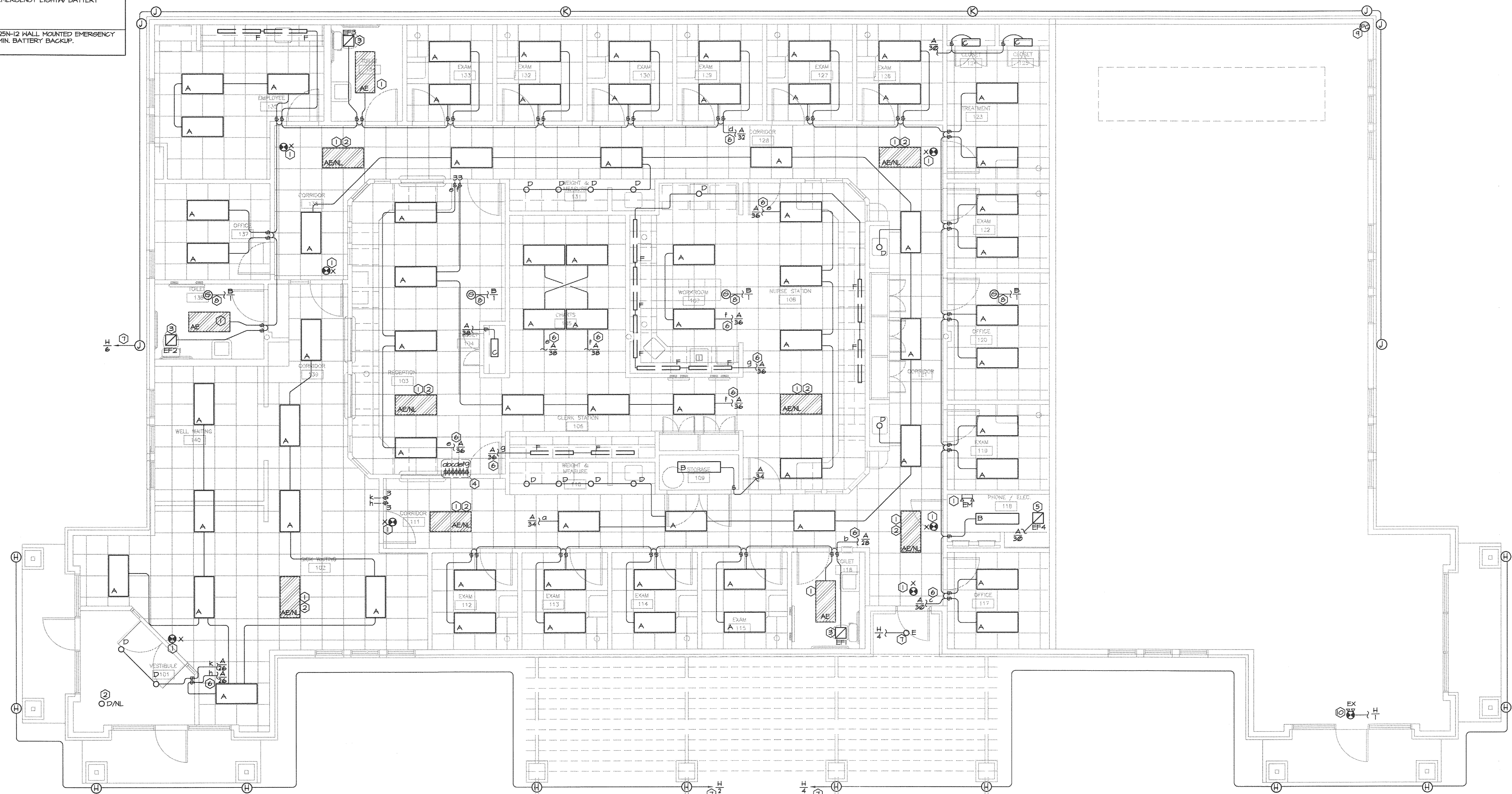
01 LIGHTING PLAN