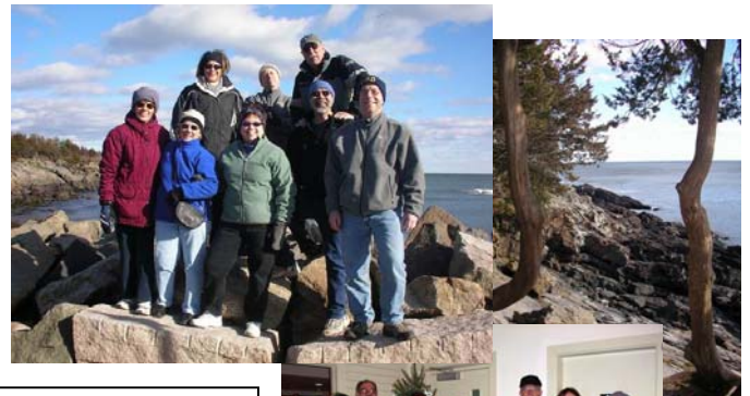
Christmas at Strawbery Banke

(Dues are $25 member, $40 family, and $15 for students)