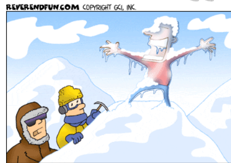
EXCITED NEW CHRISTIANS TEND TO SHOUT IT FROM THE MOUNTAINTOP WITHOUT THE PROPER ATTIRE