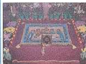
Grave for Good Friday

greens. Sometimes a priest will wear vestments with green on the Theophany as well because of the Holy Spirit coming upon Jesus and revealing the Trinity.