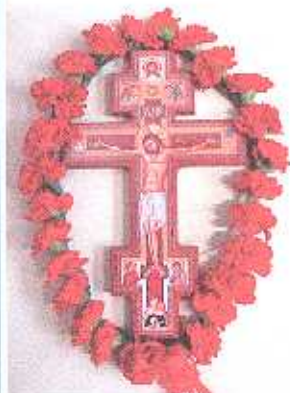
Cross for the Feast of the Exaltation and Veneration Sunday