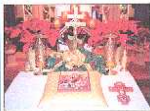
Tetrapod at Christmas