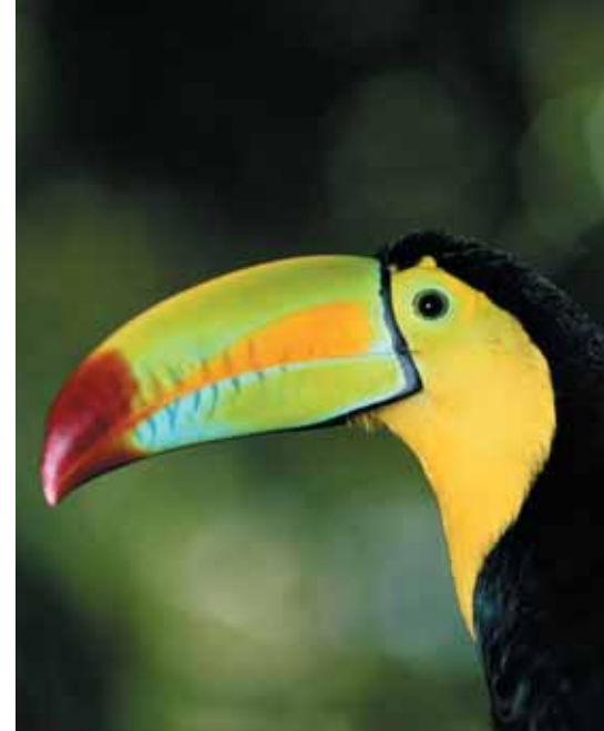
Tropical birds are just some of the wildlife you'll observe in the Costa Rican rain forest.

Continue to Puerto Viejo de Limón • Continue to Puerto Viejo, in the province of Limón. Known for its sparkling beaches and outdoor activities, including hiking, snorkeling and surfing the renowned Salsa Brava wave, Puerto Viejo is the end of the line along Costa Rica's Caribbean coast.