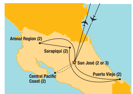
Number of overnight stays in parentheses.

Boat excursion • Enjoy a breathtaking view of the Arenal Volcano during a boat excursion across the lake. The volcano, whose perfect conical shape emerges from the green hills of