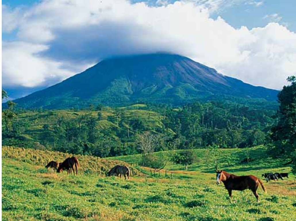
On a clear night, red lava spewing from the Arenal Volcano in Costa Rica can be seen lighting up the sky.

Learn before you go www.eftours.com/pbscostarica