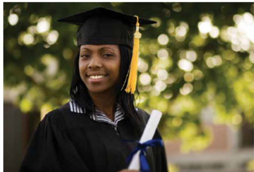
Thanks to your donations, the Pacific Northwest Kiwanis Foundation provided $13,000 in scholarships to 12 students in 2005/06, plus another $5,000 to support leadership training for Circle K.