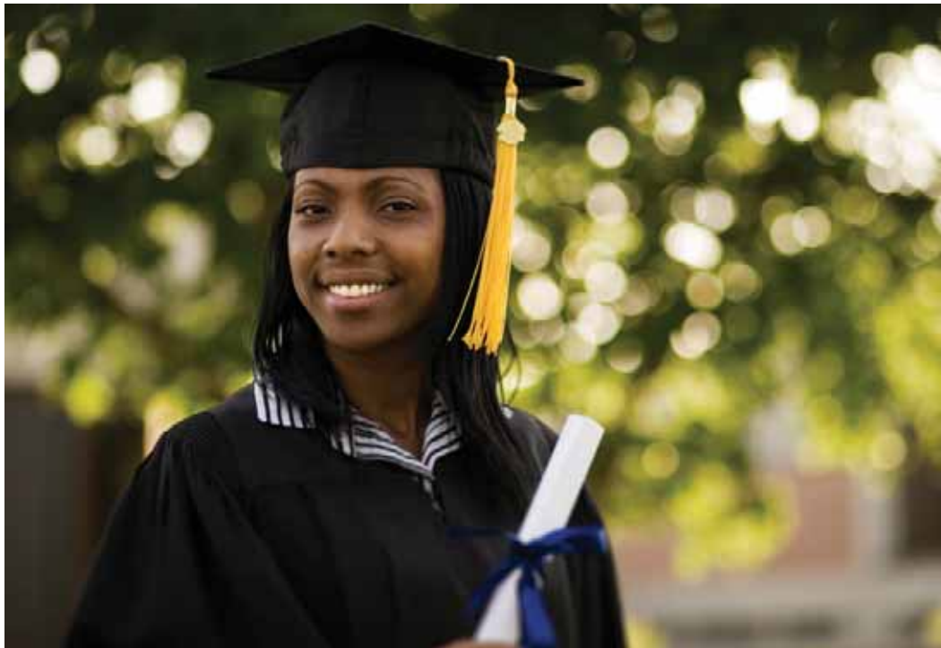
Thanks to your donations, the Pacific Northwest Kiwanis Foundation provided $13,000 in scholarships to 12 students in 2005/06, plus another $5,000 to support leadership training for Circle K.