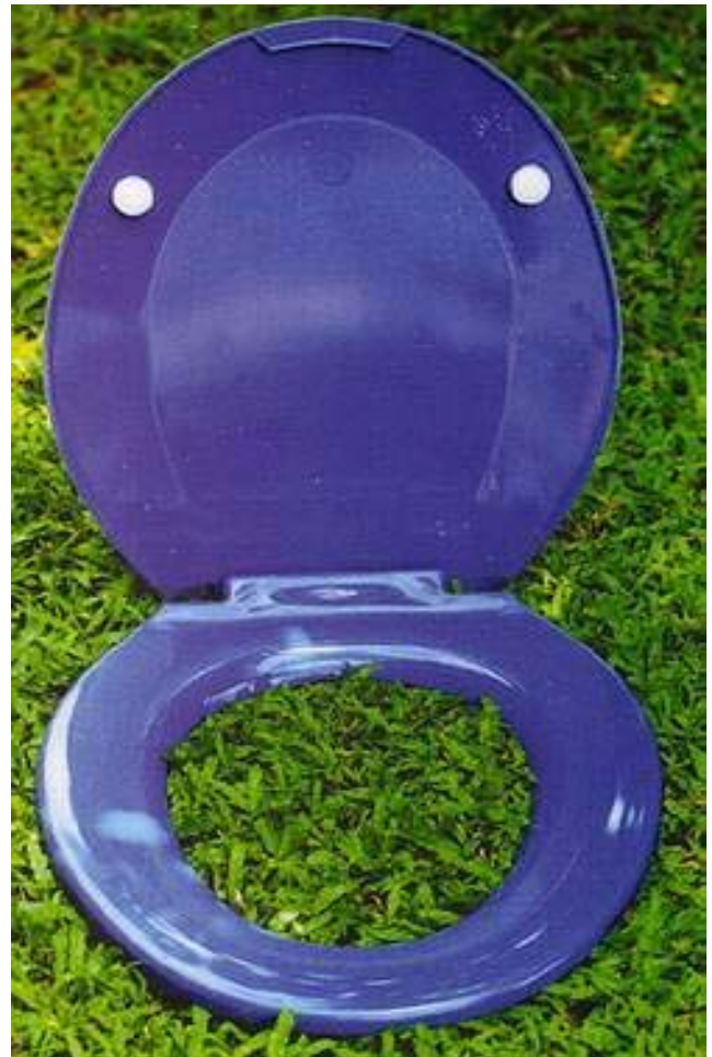
Toilet Seat & Cover (A.B.S)