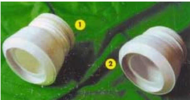
1. 4" WC Connector – High 2. 4" WC Connector - Short