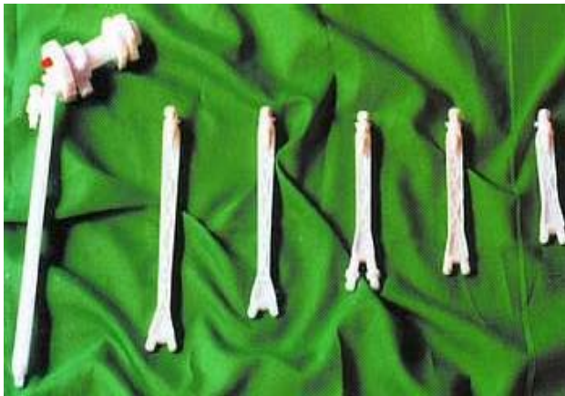
Side Inlet Ballvalve c/w Lever – 3 1/2", 4 1/2", 5", 6", 7" & 9"