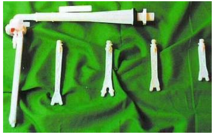
Bottom Inlet Ballvalve c/w Lever – 3 1/2", 4 1/2", 5", 6", 7" & 9"