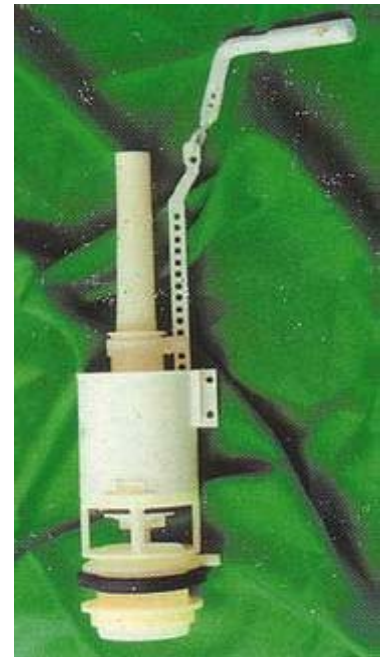
Flapper Valve Handle Type Body