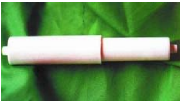
Plastic Roller for Paper Holder