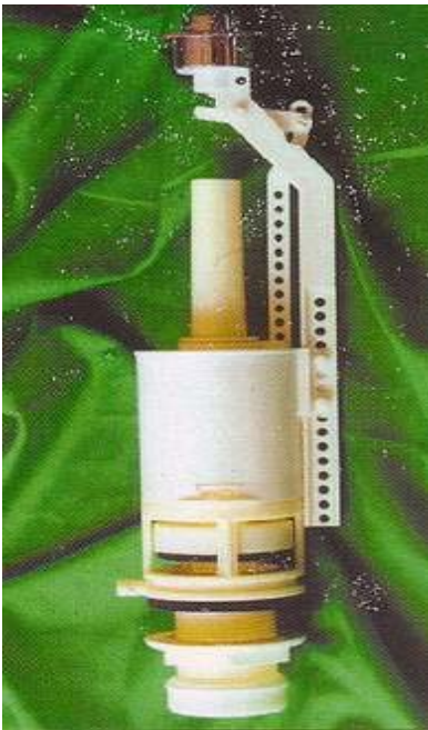
Push Button Single Flush Body