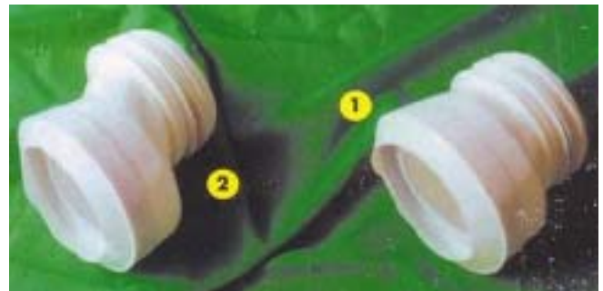
1. 1" Offset Connector 2. 2" Offset Connector