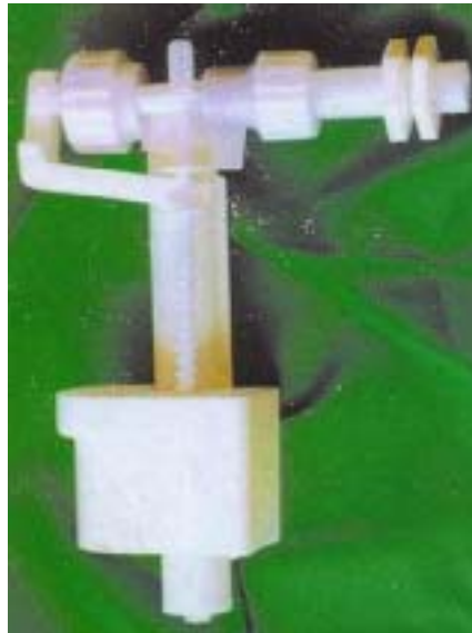
High Pressure Side Inlet Ballvalve