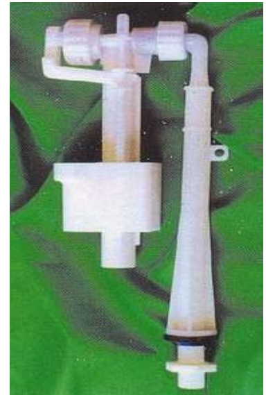
High Pressure Bottom Inlet Ballvalve