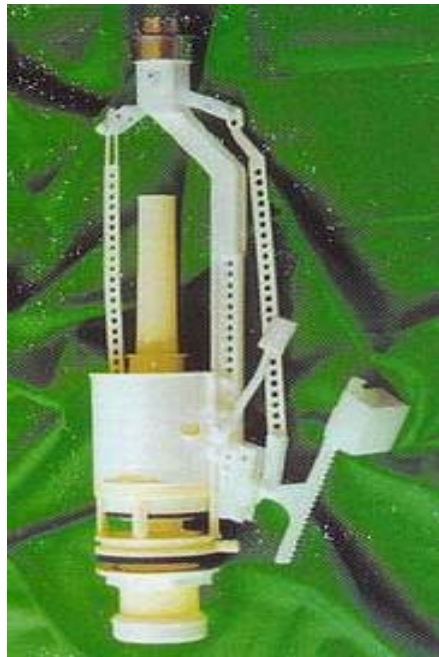
Push Button Dual Flush Body