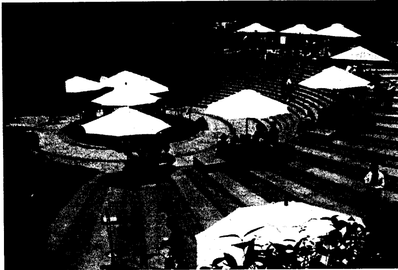
Figure 4 Bunker Hill, "prime 'crete"

bition immediately northeast of L.A., at Simi Valley's Ronald Reagan Presidential Library. Simultaneously, the L.A. Metro Blue Line light rail had entered service at a terminus buried deep beneath Bunker Hill's southern fringe. Two years later, this Blue Line was spliced onto a Red Line heavy rail subway. Emerging from a hub in the municipal government's Civic Center, the rail-cabs run adjacent to Bunker Hill and, predictably, dogleg around the old city center.