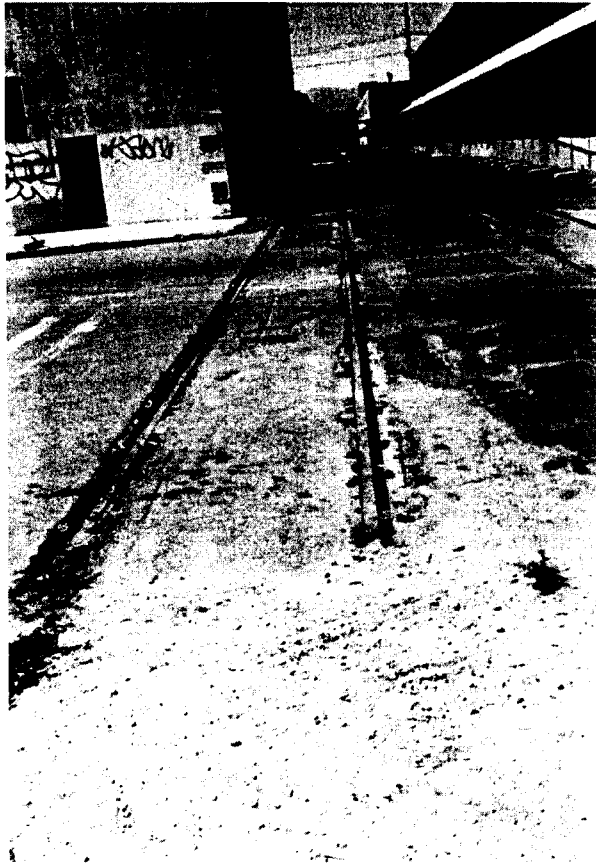
Figure 3 Warehouse District: rails to nowhere

1990). Those of Mad Dog's parents who are present work long hours at poorly recompensed jobs, some minimum and sub-minimum wage. They are largely transit-dependent, thus precluding ready transport to and from skate parks. They live in apartment buildings wedged onto small sites that leave no space for the installation of large obstacles, even if the required raw materials were affordable. So Mad Dog's members look to the streets and, in the process, have contributed to the evolution of a "street style" of skating.