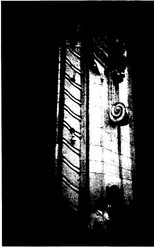
Figure 5 Old Downtown and new watcher

video cameras keep watch over the plazas, there remain blindspots that await, and even invite, inhabitation by unforeseen and potent alternative practices. Even in a totally rebuilt and totalizing environment like Bunker Hill, panopticism fails. This failure enables resistances to persist and even make themselves at home. The inevitable selectivity and positionality of any surveillant eye's view entails the simultaneous production of blindspots harboring spaces that must remain less well attended to. In Mike's words, "So long as there's a space nobody's paying attention to, I've got a place to play".