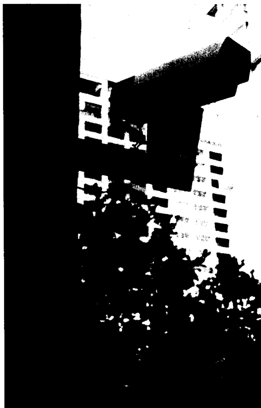
Figure 1 Saturated with observation cameras

that, when punctured, gives up its haze and floats to the ground without bursting.