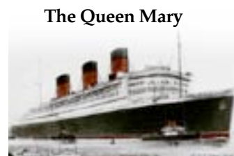
The Queen Mary