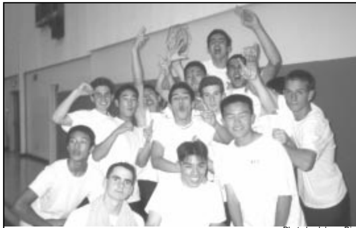
MEMBERS of the Junior Boys' Volleyball team show lots of spirit after winning this year's tournament over the Seniors.

From the first serve, the Juniors controlled the game. Both classes had the potential to win, but in the end the Seniors were no match for the Class of 2001.