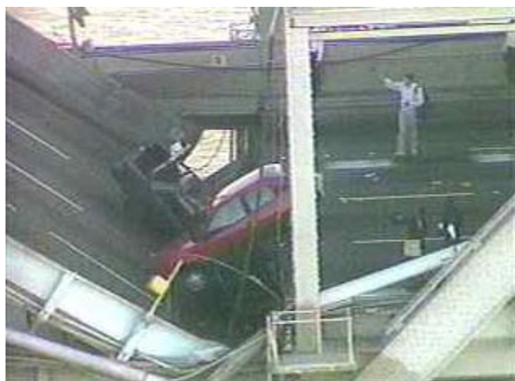
LOMA PRIETA QUAKE reminds Bay Area who's boss.

But as the threat of an earthquake continues to be echoed, let's make sure we don't go overboard.