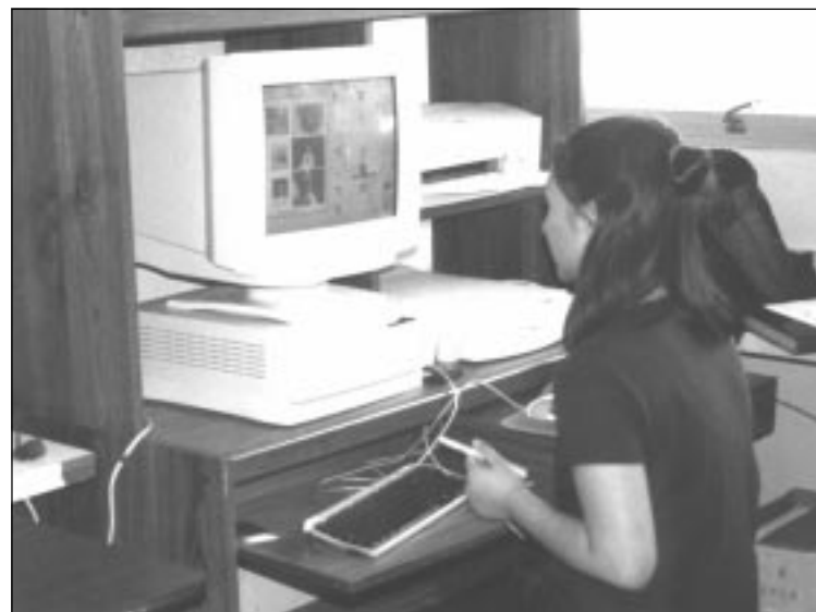
ALTHOUGH CHEATING off the Internet may sound like an easy alternative to real work, it can have severe consequences.

Currently Albany High School does not enforce a school wide policy concerning plagiarizing