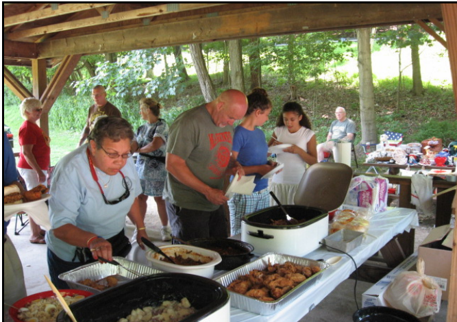
These picnickers are enjoying a terrific variety of tasty food.