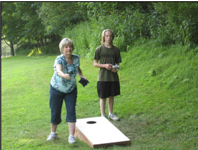
Picnickers enjoyed playing numerous games, such as this bean bag toss and a 50/50 “closest to the pin” golf game.