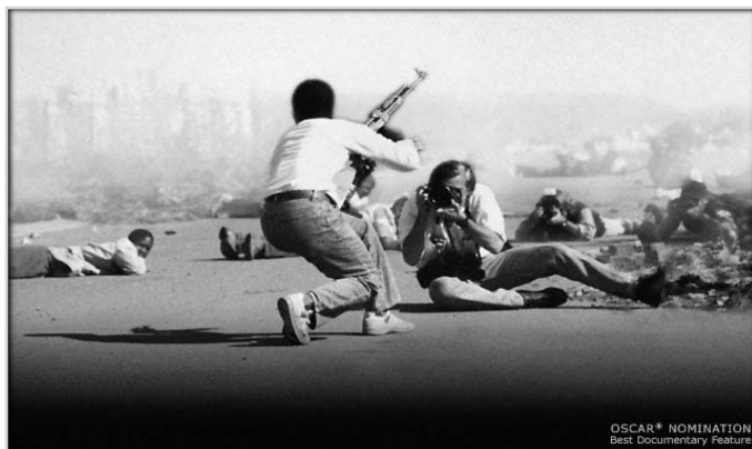
OSCAR® NOMINATION Best Documentary Feature

'Wild Horses, Unconquered People' explores the intriguing relationship between the Xeni Gwet'in, a tiny band of Tsilhqot'in Indians, and hundreds of wild horses that mysteriously roam B.C.'s rugged Nemiah Valley - described as Canada's Nepal. For what is arguably North America's last true horse culture, the untamed spirits are an economic and spiritual resource - a powerful icon in a century-old fight with the government and non-native entrepreneurs for control of this unconquered land.