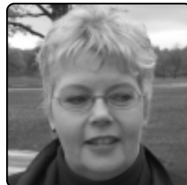
Alex Young Recreational Program