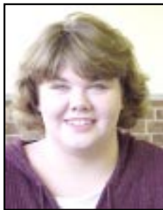
By Kim Morava SPJ vice president

Journalism workshops — we've all been there. Some rejuvenate your mind and promote endless enthusiasm for the craft. Others can make a root canal more appealing.