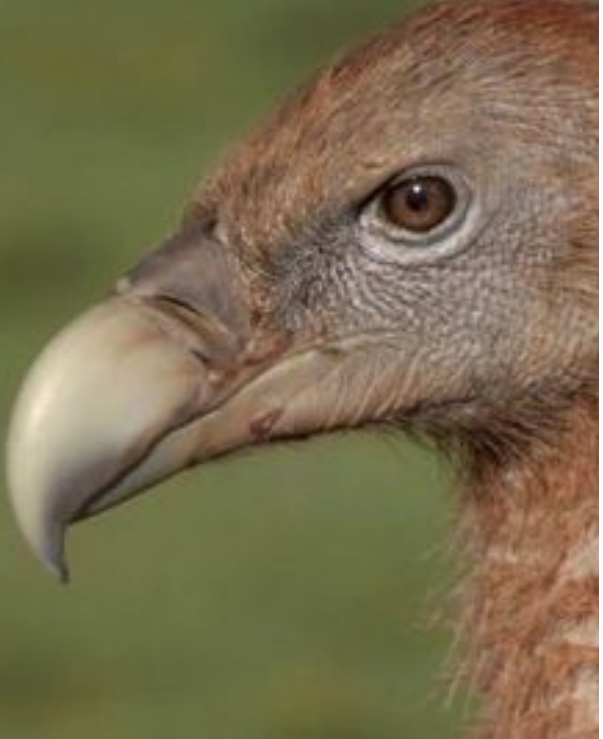
Top: Flying Vultures Bottom Left:Sky Burials: Tradition Becomes Controversial Tourist Attraction Bottom Right: Vulture Eye