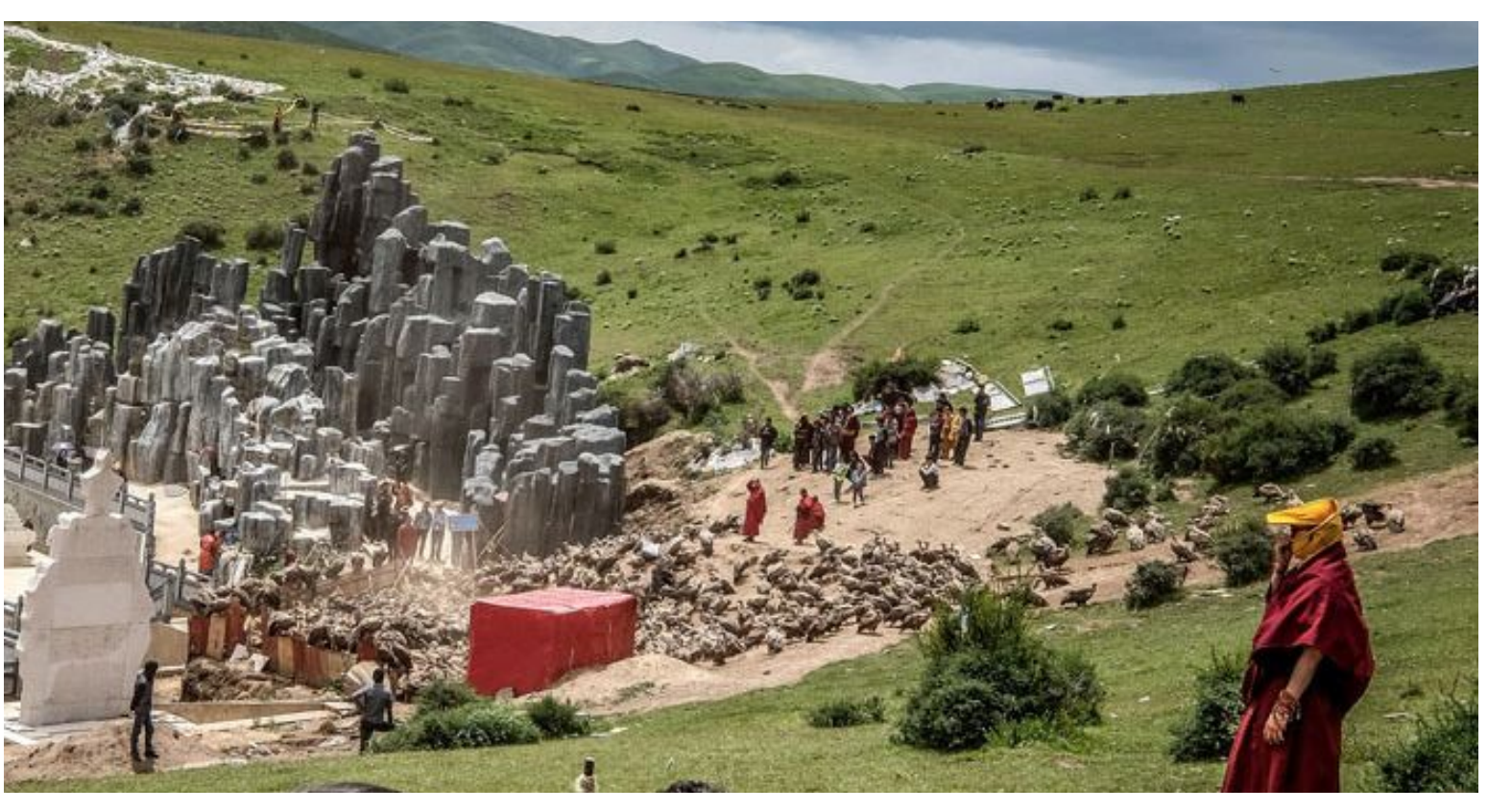
Scene of Sky Burial in Larung Gar Buddhist Academy