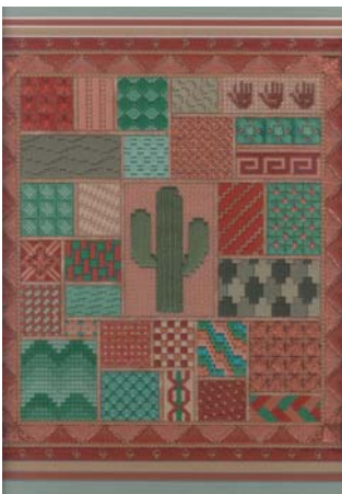
Southwest Sampler stitched on 18 count canvas in either the coppers and turquoises or peach and medium greens