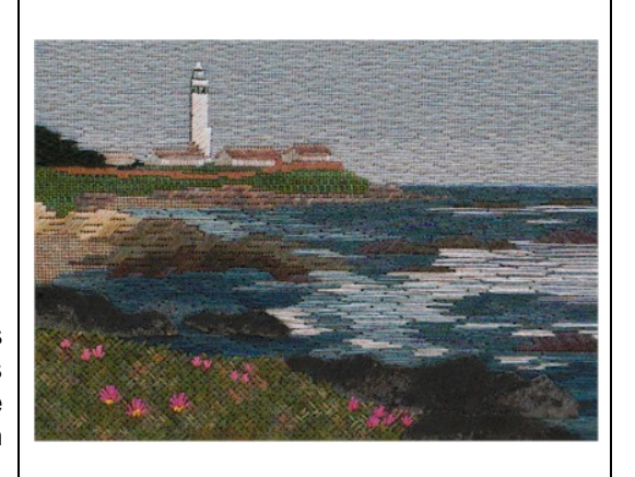
Pigeon Point Lighthouse By Lois Kerchner

Contact Debby Power to reserve your space. Cut out coupon below and mail to Debby with payment.