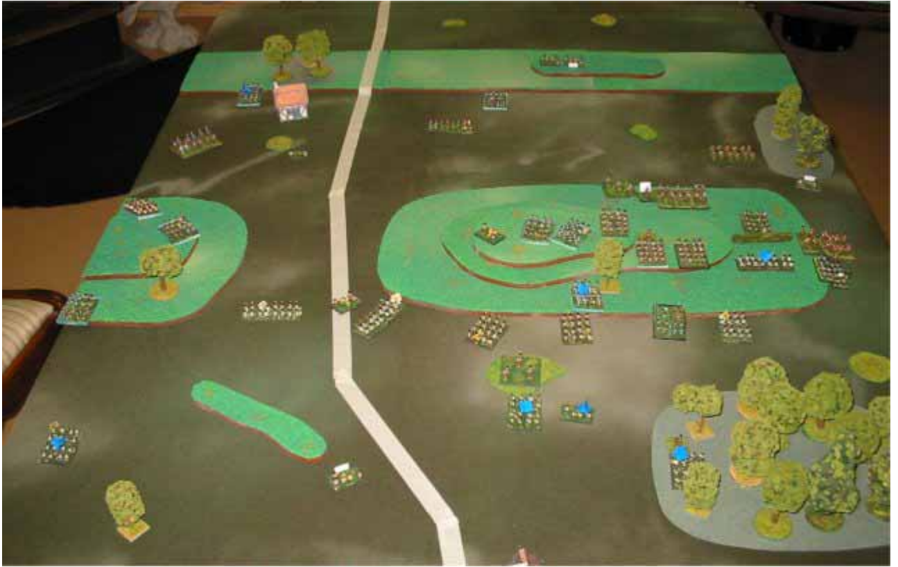
The French smash the Austrian line on both hills.