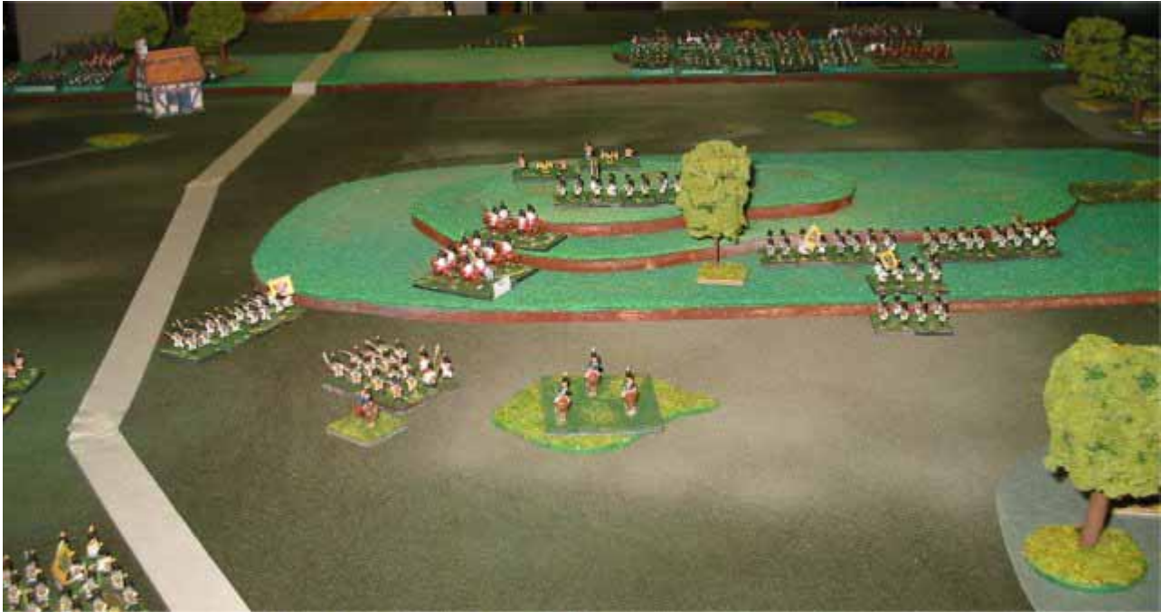
The main Austrian defensive position

This game was a solo play test of a set of rules I cobbled together from several other rules sets and the Talonsoft's computer games. It features my French versus my Austrians. It was also a chance to play with my new camera (digital of course)