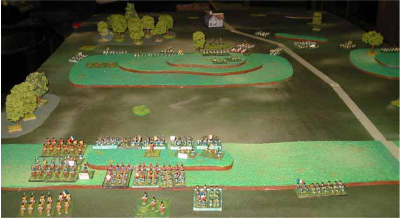
The main French body.