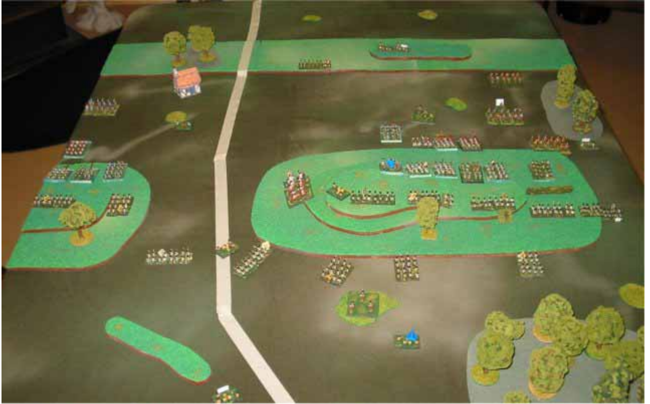
The French reach the summit of the left hill where the Austrians await them, the Austrian heavy cavalry prepares to clean the front of the right hill of living Frenchmen.