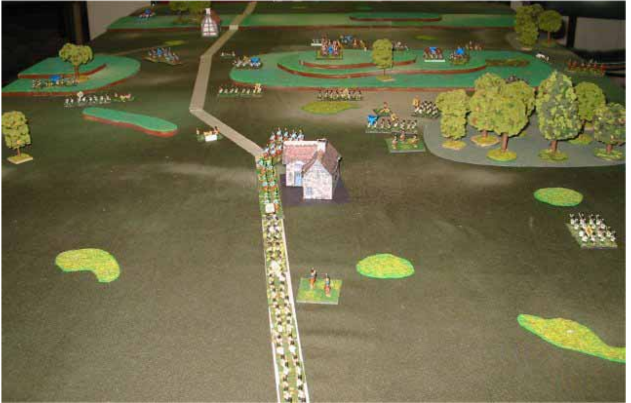
Austrian Reinforcements begin streaming onto the battlefield.