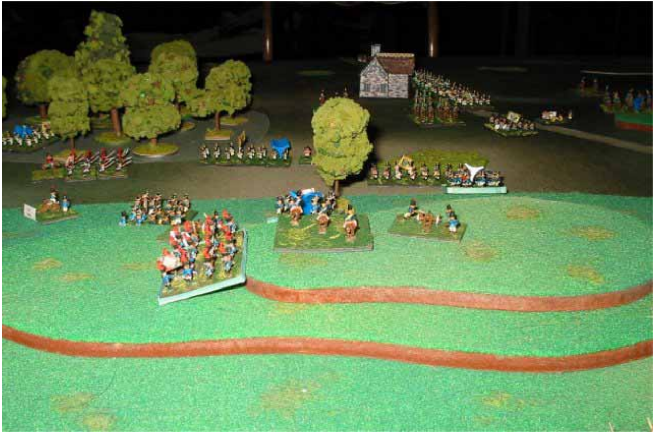
The French Commander in chief urges his Guard units forward.