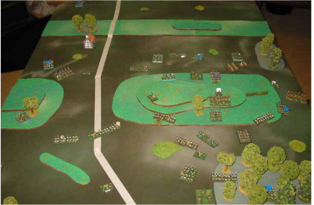
The Austrian guns on the road crush the French advance on the left