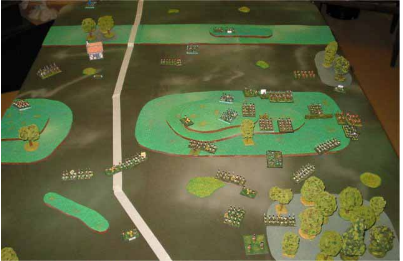
The Austrians reform and push back the French Spearhead.