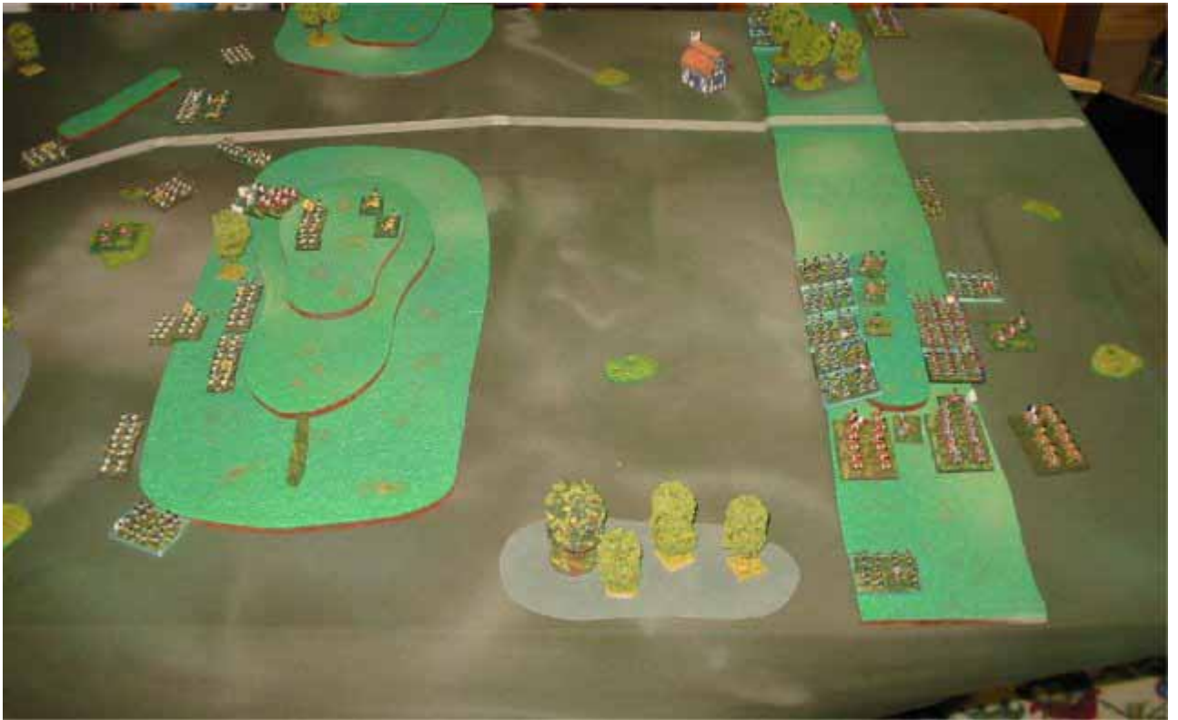
Both armies depicted French on the right