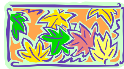
October is here!