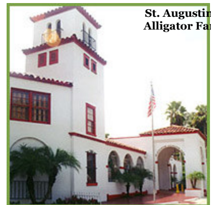
St. Augustine's Alligator Farm.