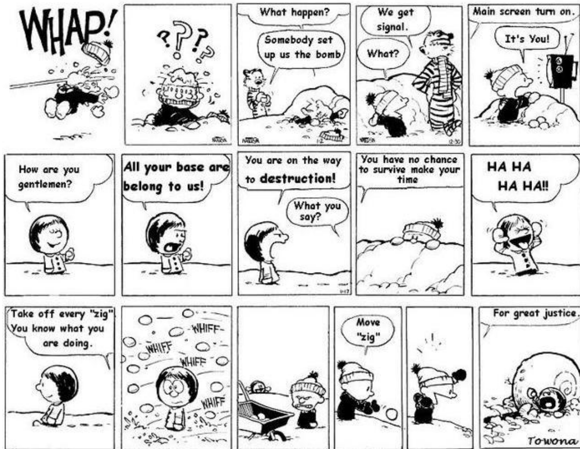
Figure 1 - War as an effect of the human cyclical nature

Danelle E. Brown Amer Her – Section 021 November 13, 2002