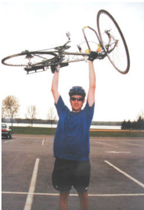
100-mile Ironman Ride

I will be publishing a post-ride newsletter filled with stories, pictures, and anecdotes after the ride is over. Very exciting...watch for it!