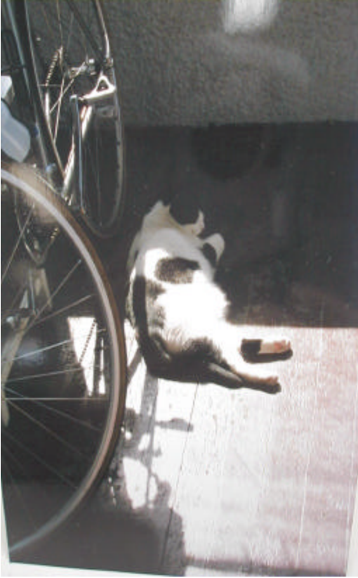
Bailey, the biker cat...