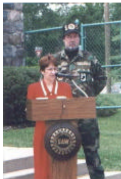
Mysteriously, Rivers was stalked by this man throughout the campaign.

Michigan 15 voters booted long-time incumbent John Dingell out of office this month, handing another ticket to DC to Representative Lynn Rivers. The working mom and champion of women's rights and the environment will be back in DC this fall as part of the Democratic House majority to resume the fight for progressive issues.