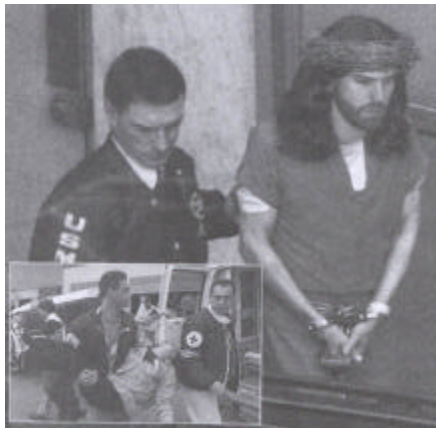
Anti-Choice activist and Christ-imitator lead away from clinic for violating FACE laws.

Pictures play a critical role in the poignant story of sidewalk