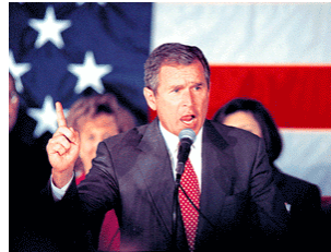
Bush: "...we can totally own the entire region."

During one of his few public appearances, last Tuesday President George W. Bush outlined his administration's comprehensive plan for the middle east.