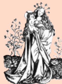
Mary, the first Steward of Christ