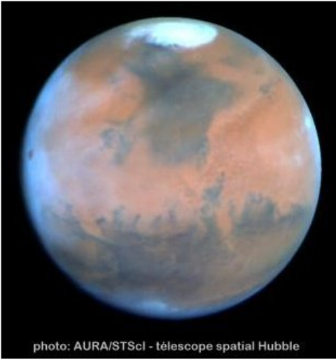
télescope spatial Hubble