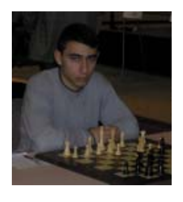
IM Varuzhan Akobian